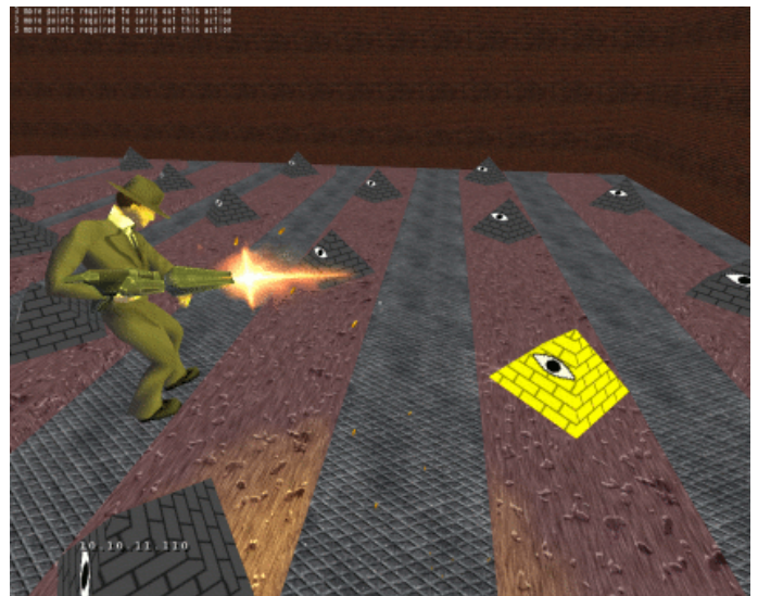
Fig. 14. A collaborating network administrator marks a greynet for ACL placement.

the attacking host and the shot entity returns to a grey colour.