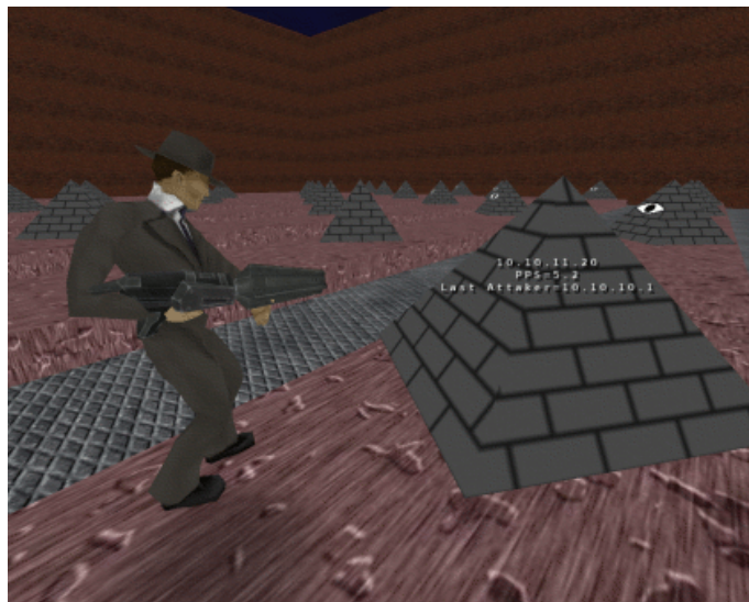
Fig. 2. Moving closer to a greynet entity reveals additional information in the form of a textual overlay.

Users of our L3DGEWorld 1.0 tarball saw pyramids representing the hosts of the associated greynet under scrutiny as in Figure 2. This was an improved version